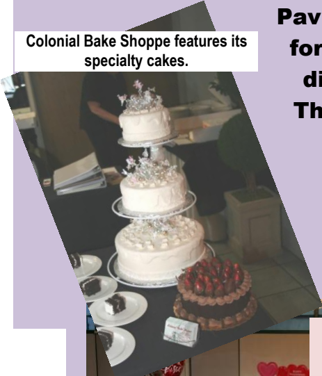
Colonial Bake Shoppe features its specialty cakes.