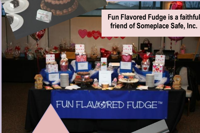
Fun Flavored Fudge is a faithful friend of Someplace Safe, Inc.