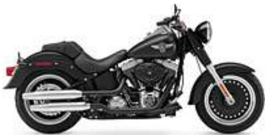
Pictured above, Harley Davidson Fatboy®

The group expressed an interest in hosting a bike run expressly for supporting the work of Someplace Safe, Inc. and to generate funding to meet the needs of domestic violence victims. The Agency was chosen, in part, because one of the members of the LHR found herself in need of our services some years ago. She wanted to give back to the Agency and express her appreciation. The member said that Someplace Safe helped her get back on her feet so she could start making good choices.