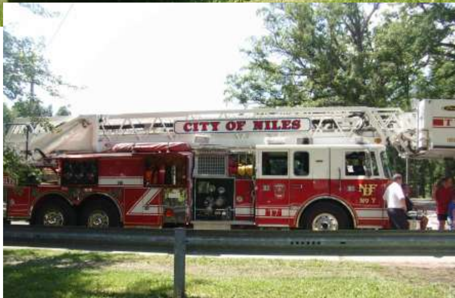
Niles Fire Department